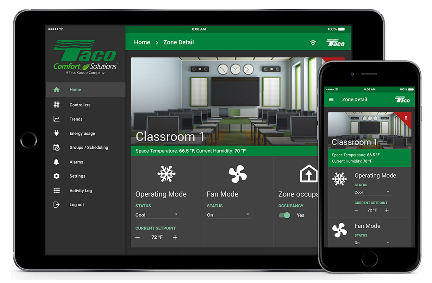
These QA Graphics design concepts show the updated UI for Taco's building management tool, LCI-4. Mobile and tablet designs were provided for each screen to help developers build a responsive application.

The theme did not encompass the company's brand and style. The LCI-3 tool also lacked the equipment graphics which had become expected by the market. Taco offered other options to provide standard graphics to their customers, but these standardized graphics did not give Taco's building management tool the personal touch clients wanted. Taco wanted to create a custom graphics package, but didn't have any in-house graphic design resources.